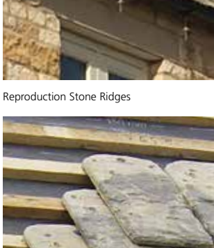
Traditional Slate Peg Fixing