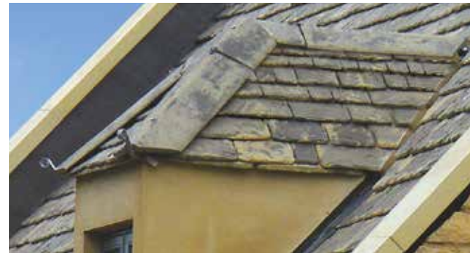
Reproduction Stone Hip Ridges