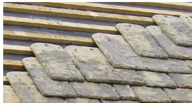
Traditional Slate Peg Fixing