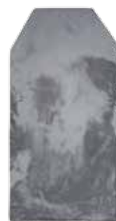
Reproduction Reclaimed Grey Slate