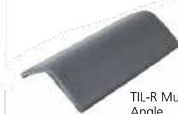
TIL-R Multi Angle