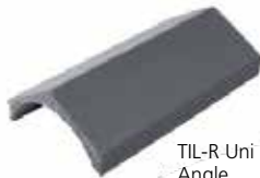
TIL-R Uni Angle