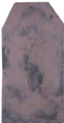
Reproduction Reclaimed Purple Slate