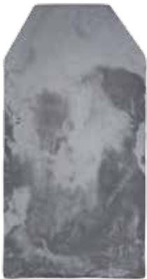
Reproduction Reclaimed Grey Slate