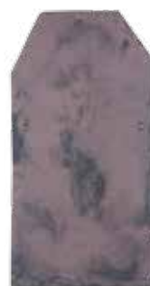
Reproduction Reclaimed Purple Slate