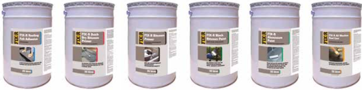
Roofing Felt Adhesive